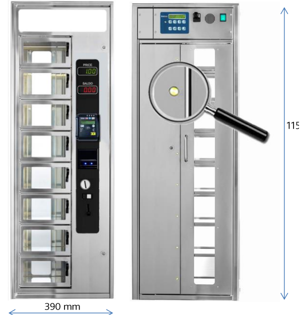
MAXI Wide front and rear view

Width 390mm - Height 1150mm Double backdoor - Digital menu (kitchen side) Easy price configuration through menu - Sales and temperature information - Digital temperature control Prepared for CC payment system (NFC & others) MDB 4.2 Level 1 protocol for cashless integration Build according EVA standard for easy cashless reader installation. -Food control System - MOVE system - Model displayed with only cashless reader, and optional stainless steel full front plate Additional space for optional bank note reader