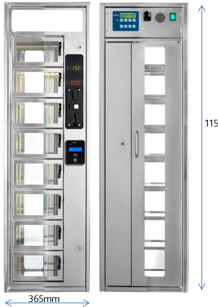
BASIC 365 front and rear view

Width 365mm - Height 1150mm Double backdoor - Digital menu (kitchen side) Easy price configuration through menu Sales and temperature information Digital temperature control Prepared for CC payment system (NFC & others) - MDB 4.2 Level 1 protocol for cashless integration Build according EVA standard for easy cashless reader installation.