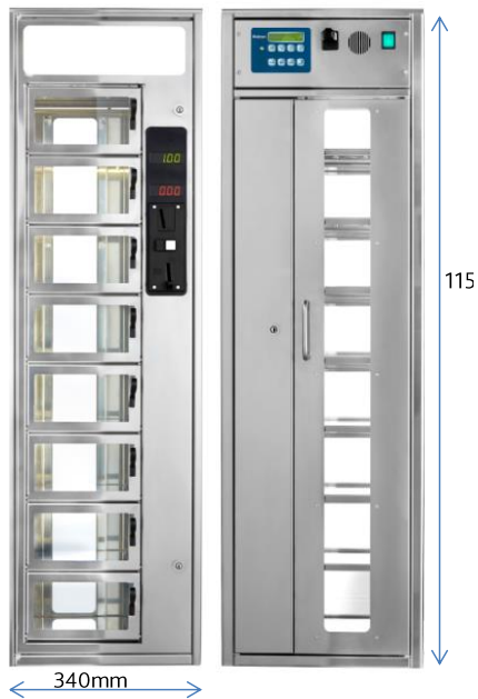
BASIC model S - 340 front and rear view

Width 340mm - Height 1150mm Double backdoor Digital menu (kitchen side) Easy price configuration through menu Sales and temperature information Digital temperature control Prepared for CC payment system (NFC & others) MDB 4.2 Level 1 protocol for cashless integration Cashless readers installation from factory (optional)